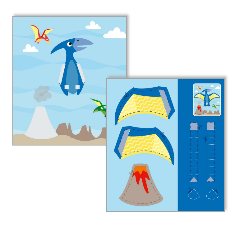
Quick Quick - Ready!