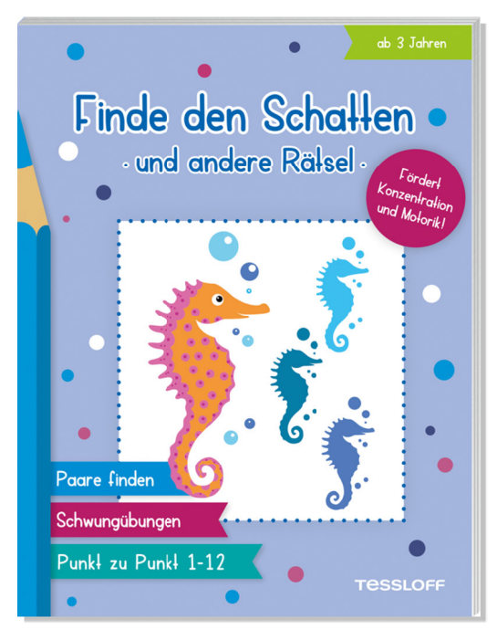
Spot the Shadow