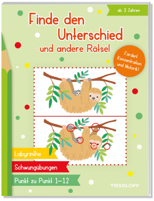
Find the Difference