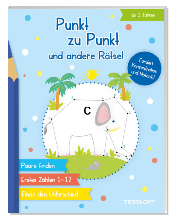
From Dot To Dot