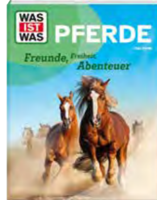
Horses. Friends, Freedom, Adventure