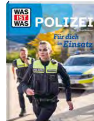
Police. On Duty for You