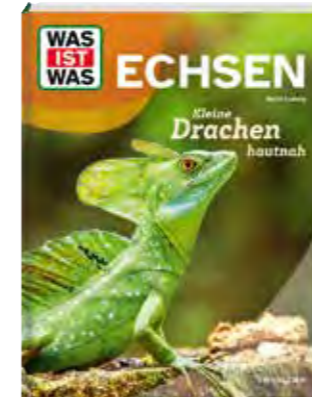
Lizards. Little Dragons up Close