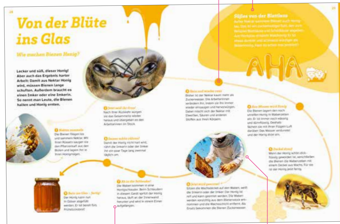
Clear, reader-friendly layout for easy orientation

Without further ado, here's what the new WAS IST WAS looks like: