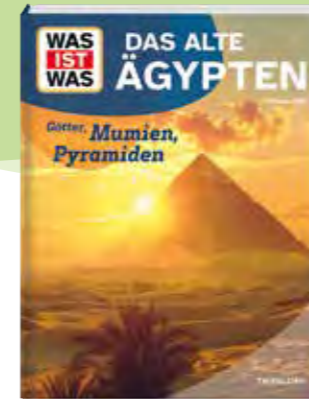
Ancient Egypt. Gods, Mummies, Pyramids