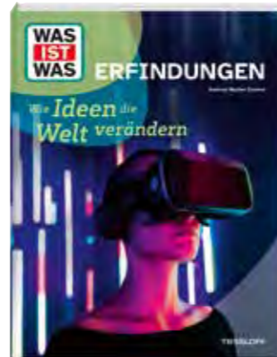
Inventions. How Ideas Change the World