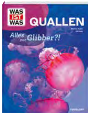
Jellyfish. Is It All Just Goo?