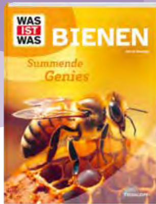
Bees. Buzzing Geniuses