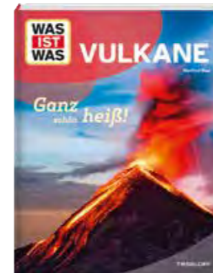
Volcanoes. Pretty Hot!