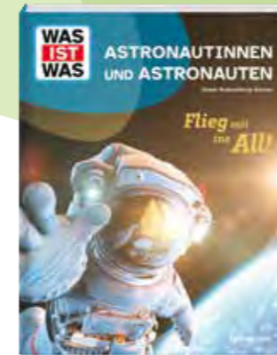
Astronauts. Fly to Space with Us!