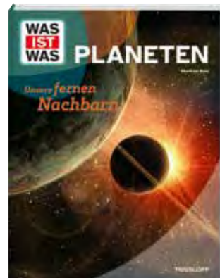
Planets. Our Distant Neighbours