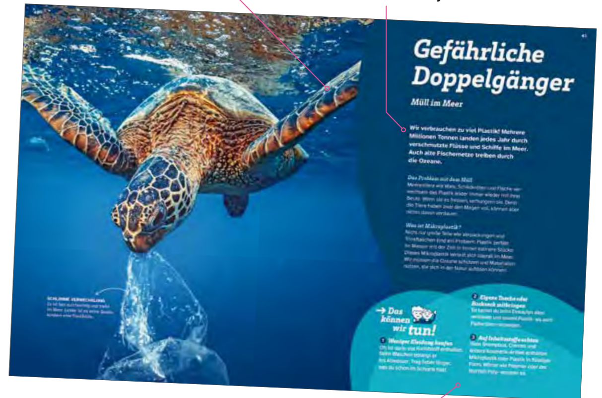
Empowerment through easy-to-follow action tips