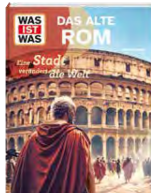
Ancient Rome. A City That Changed The World