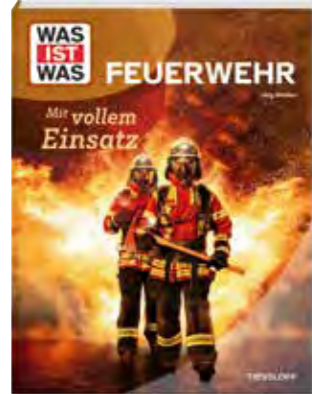
Firefighters. Full Commitment