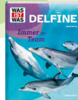
Dolphins. Always in a Team