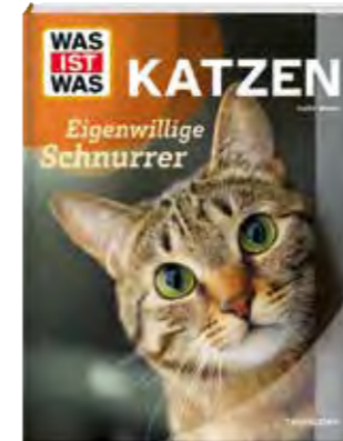
Cats. Strong-Willed Felines