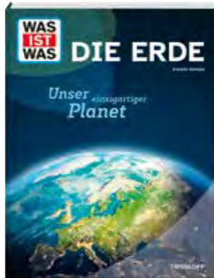
The Earth. Our Unique Planet