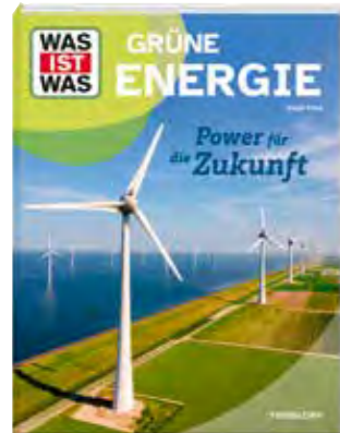
Green Energy. Power for the Future