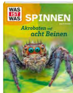
Spiders. Eight-Legged Acrobats