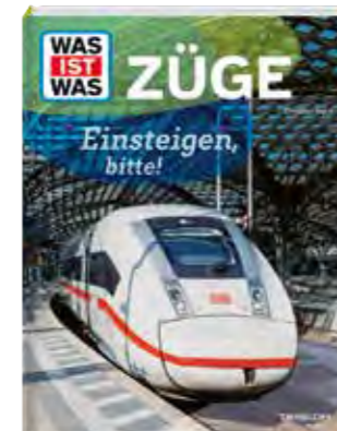
Trains. All Aboard!