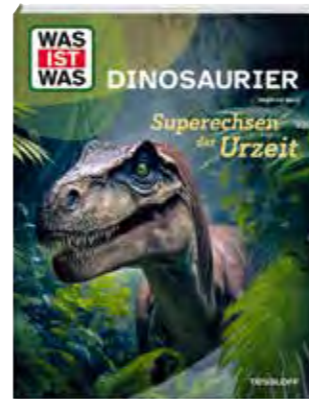
Dinosaurs. Super Lizards of Prehistoric Times