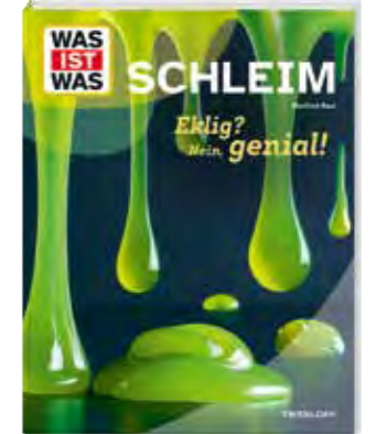
Slime. Gross? No, genius!