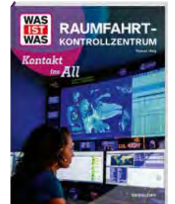
Mission Control Center. Contact to Space