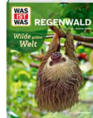
Rainforest. Wild Green World