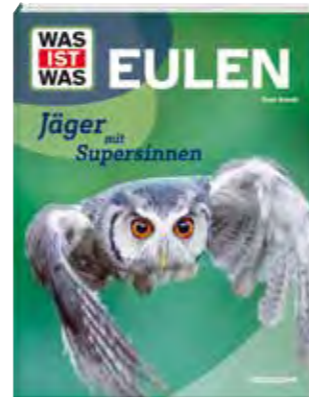
Owls. Hunters with Super Senses