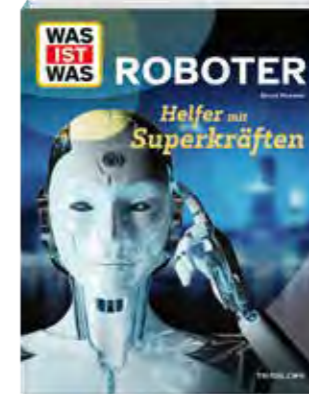
Robots. Helpers with Superpowers