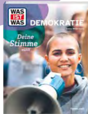
Democracy. Your Vote Counts