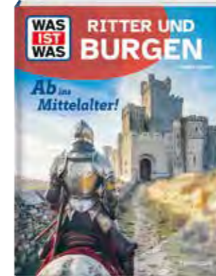
Knights and Castles. Let's go to the Middle Ages!