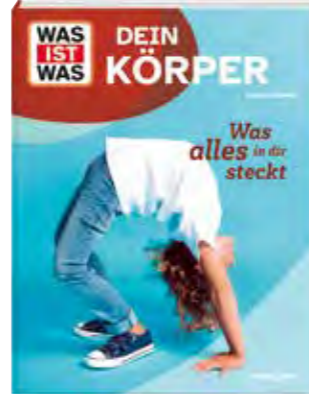
Your Body. Everything you're made of