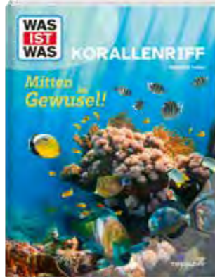
Coral Reef. Right at the Heart of it all