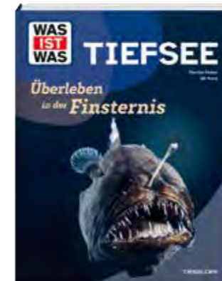
Deep Sea. Survival in Darkness